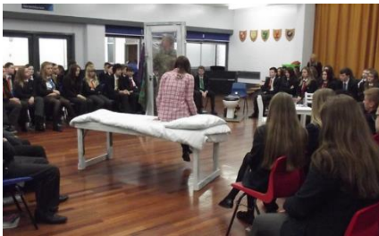
Theatre show for mental health support