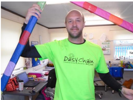
Charity events—Stand up to Autism