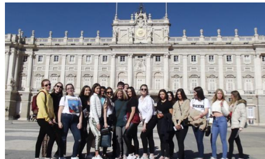
Trips and visits