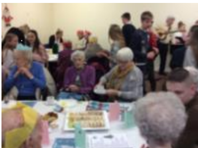
Community Event—Christmas Party