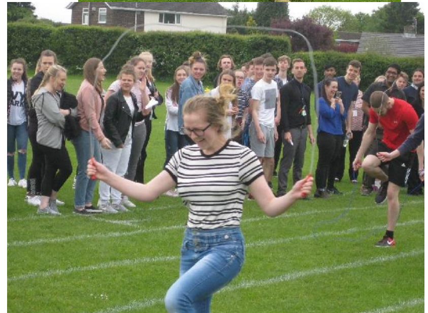
Year 13 Sports Day